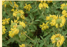
Phlomis fruticosa Jerusalem Sage