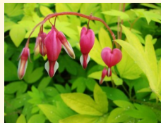
Dicentra spectabilis 'Gold Heart' Bleeding Heart