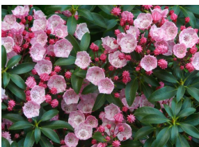
Kalmia Mountain Laurel