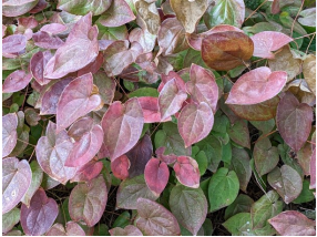
Epimedium Bishop's Hat