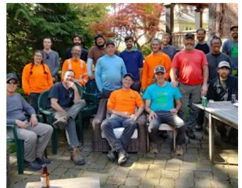
Group shot of arborists who participated in the Arbor Day Prune.